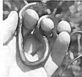
▲ Smooth Greensnake - Opheodrys vernalis