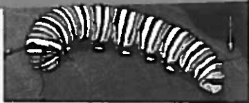
▲ Monarch caterpillar - Danaus plexippus Keep an eye out around milkweed