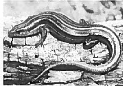
▲ Common five-lined skink - Plestidon fasciatus • Ontario's only lizard!