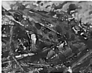
▲ Northern Leopard Frog - Lithobates pipiens

All common to this area of the province, here are several species to keep an eye out for while stepping into Elgin County nature this summer. Of course, hunt only with binoculars and follow the golden rule of nature walks: take only pictures, leave only footprints.