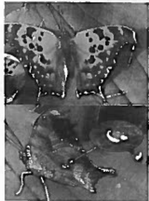
▲ Question Mark Butterfly - Polygonia interrogationis • Look for the "question mark" marking in silver on hindwing