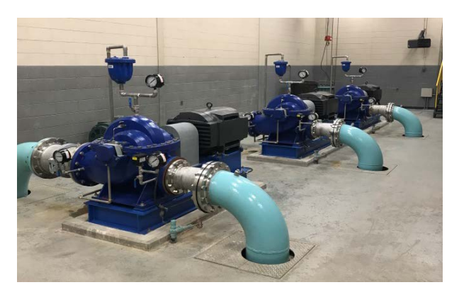
High Lift Pump Station:

The three high lift pumps provide redundant pumping capacity into the STASWSS. The St. Thomas pumps are equipped with variable frequency drives (VFD) with each pump having a rated capacity of 263 L/s. With the current VFDs being utilized as soft and stop variable frequency drives.