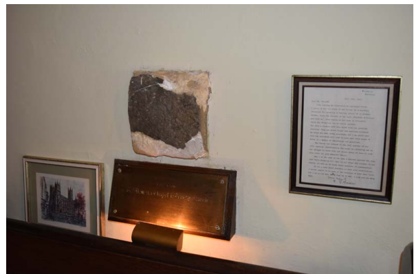
Figure 13: Stone from Canterbury Cathedral

3) The property has contextual value because it,