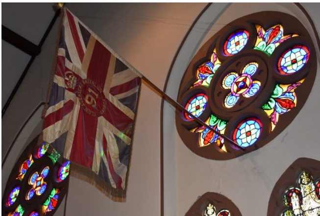
Figure 10: Colours of the 91st Battalion of Elgin

The colours of the "Elgin Regiment" (Figure 10), as well as the colours the "91st Battalion of Elgin" (Figure 11), St. Thomas' overseas unit during WWI, are displayed as a tribute to the fallen heroes of both the First and second World Wars (4).