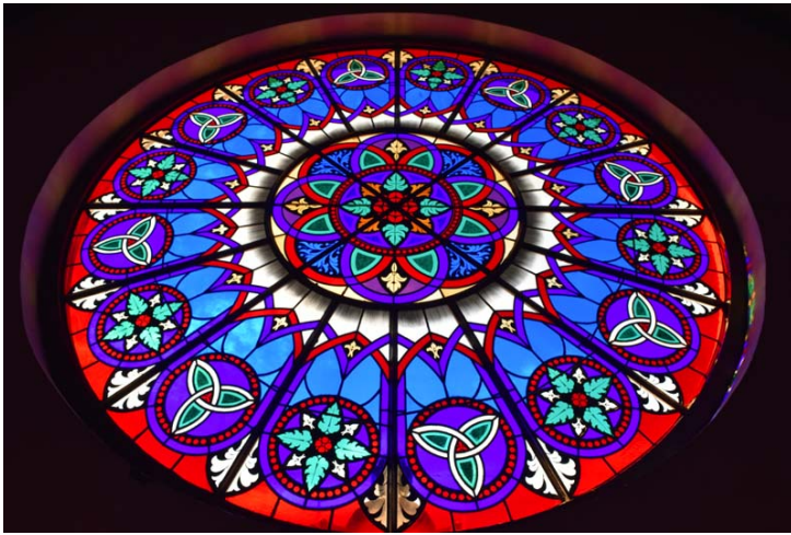
Figure 4: Stained Glass Windows (R. Belanger, 2019)