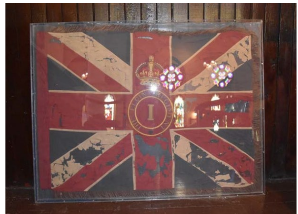
Figure 11: Colours of the Elgin Regiment

The 91 st Battalion of Elgin was formed on 25 October 1915, a year after Great Britain declared war on Germany. 940 men were trained for service under the command of Lt.-Col. Green, and it received its colours on 24 May 1916 after a parade through St. Thomas, which ended at Pinafore Park. A month later on 25 June 1916, the battalion was dispatched overseas after a march down Talbot Street that was witnessed by a crowd of 20,000 people. They traveled by train to Halifax, where on 28 June they set sail on the ship Olympic, arriving in Liverpool, England on 5 July. After ten days at Otterpool Camp,