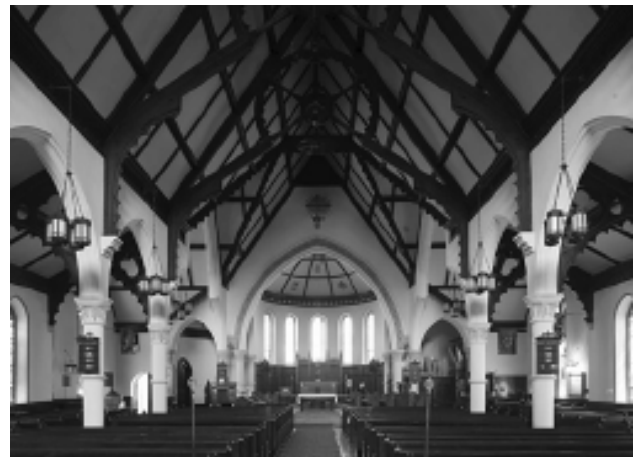
Figure 6: Trinity Church Interior (M. Thurlby, 2014)

There are many other artistic forms of various crosses within the rest of Trinity Church, symbolizing its ethnic beginnings in the English culture. Lloyd installed the “Celtic Cross” at the peak of the brick surrounding the Wellington Street entrance door (Figure 8). This “Cross” is a reminder of the antecedents in England – that is, “anti-St. Augustine” and his Roman Mission of the sixth century (1).