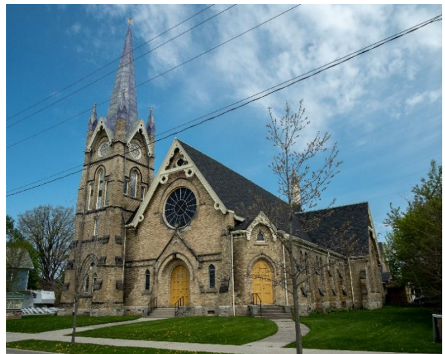
Figure 1: Trinity Anglican Church (M. Litwinchuk, 2019)

55 SOUTHWICK STREET, known as TRINITY ANGLICAN CHURCH, is an exemplary building representing the economic, cultural and architectural values of the City of St. Thomas. Trinity Anglican Church (Figure 1) was built to replace the first Church of England in St. Thomas, which was that of the Old St. Thomas Pioneer Church located at 57 Walnut Street, which opened in 1824. Due to the overwhelming growth of the congregation, a new site was sought, and found at the northeast corner of Southwick Street and Wellington Street, in the latter portion of 1876. The property was donated for