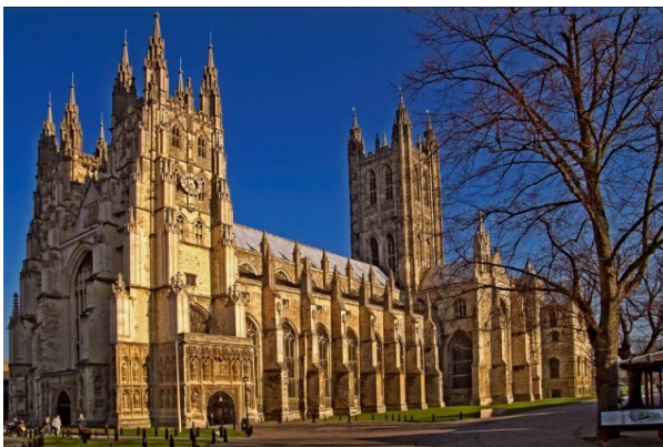
Figure 12: Canterbury Cathedral in Canterbury, Kent

The church is also home to a piece of Canterbury Cathedral in Canterbury, Kent, (Figure 12) which is one of the oldest and most famous Christian structures in England and forms part of a World Heritage Site. It is the cathedral of the Archbishop of Canterbury, leader of the Church of England and symbolic leader of the worldwide Anglican Communion. The stone was brought to Canada to commemorate the 91 st Overseas Battalion visit to the Cathedral in 1916 (Figure 13).