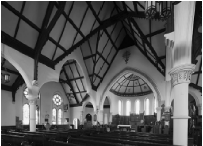
Figure 2: Church Interior (M. Thurlby, 2014)

Wood carvings adorn the main altar, altar rails, and lectern (Figure 3). While beautiful stained glass windows are found throughout the church, including large rose windows (Figure 4) and others depicting the life of Christ (Figure 5) (5).