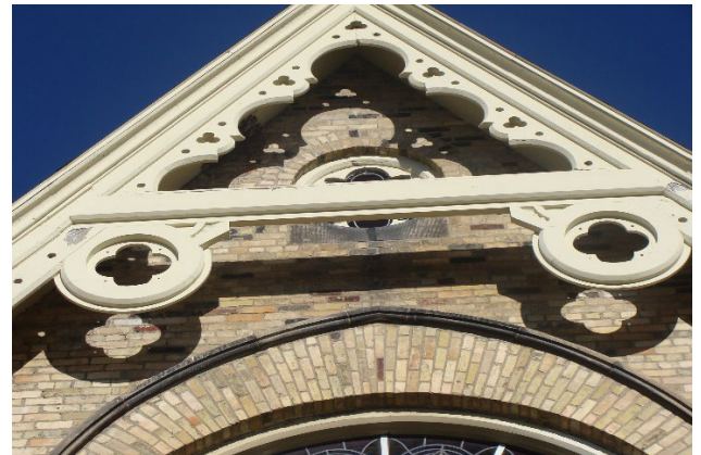
Figure 7: Bargeboards and Pendant Roundels (M. Lindsay, 2019)