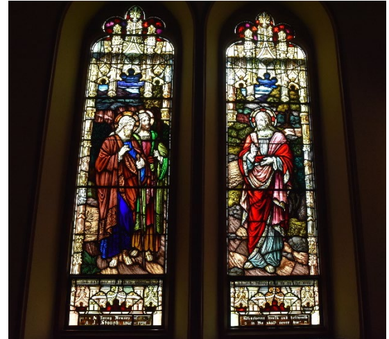
Figure 5: Stained Glass Windows (R. Belanger, 2019)

Overall, the Trinity Anglican Church building is in relatively good condition, and is currently owned by the Anglican Diocese. Any repair and maintenance to the building in the future should ensure the protection of the original design, materials, windows, and finishes of the building.