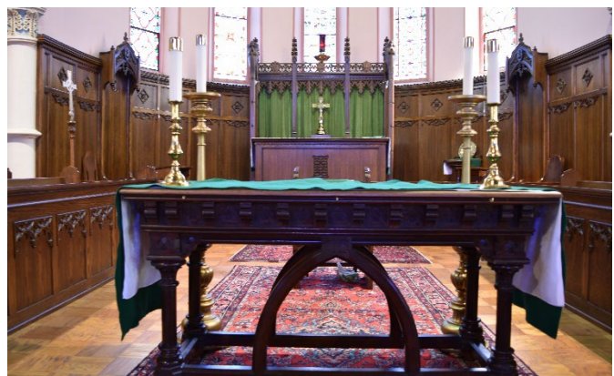
Figure 3: Detailed Wood Altar (R. Belanger, 2019)