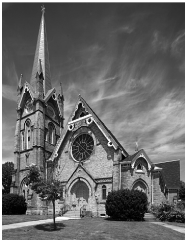
Figure 14: Trinity (M. Thurlby), 2014)

Trinity Anglican Church is absolutely a landmark on Wellington Street, within the surrounding neighbourhood, and throughout the City of St. Thomas. With its exceptional architectural detail, ornate spire, beautiful stained glass windows, and close proximity to the street, it is easily one of the most visually striking buildings within the City of St. Thomas (Figure 14). The spire also provides a visual connection to the church and can be seen from long distances away. Many generations of residents have personal connections with the church, and it remains an important part of the cultural fabric of our community.